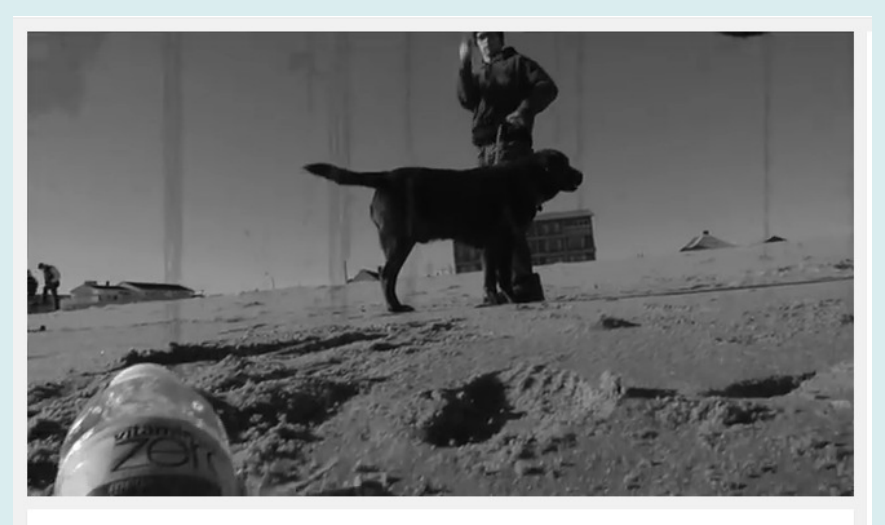
Beach Karma, Presented by Blue Ocean Society's SCOOP Program