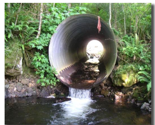
An undersized culvert ranked as “fully incompatible” that has significant downstream bed scour and bank erosion.

Fully Incompatible – The structure is severely undersized, impeding sediment transport, and causing streambed scour and bank erosion. Crossings in this category are not compatible with channel form or sediment transport process and are at a high risk of failure.