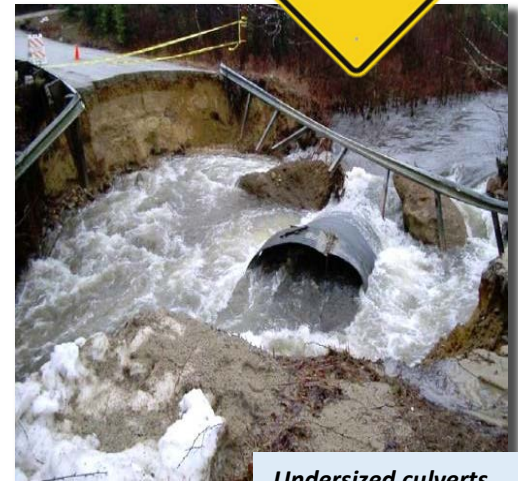
Undersized culverts can cause significant road damage!

Sediment transport refers to how water moves rocks and sand along the stream bed. Undersized or improperly-angled stream crossings increase the potential for sediments to deposit upstream of a culvert. Sediment that accumulates in front of the culvert reduces the amount of water that can pass through the pipe and increases velocity – during a storm this can lead to catastrophic culvert